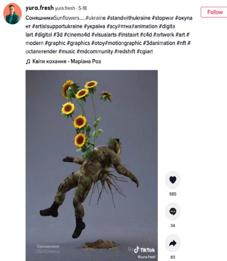
FIGURE 4: A SCREENSHOT OF A TIKTOK VIDEO BY @YURA.FRESH (2022B)

Narratives centering land as a subject give an outlet for the pursuit of vengeance and expressions of anger. In other contexts, it may be seen as cruel or morally inadmissible to enact or express a desire for revenge. However, in the context of eco-centric narratives, human feelings get attributed to inanimate objects, which allows them to escape the constraints of civil and religious morality. Cultural contextual links of romanticizing the connection to land demonstrate a pervasive aspect of mythmaking, given that the attribution of human emotions to land allows for robust forms of operationalizing difficult events and creatively channeling grief and anger. This form of projection of the war experience onto land can be a way to practice healing. By attributing the experience of the war to the land, which is more resilient to the pains of the war in the long run, the horrors of war can be put in perspective, or at the very least shared with an entity that is larger than any single human, thereby diminishing the pressure on the individual and the community.