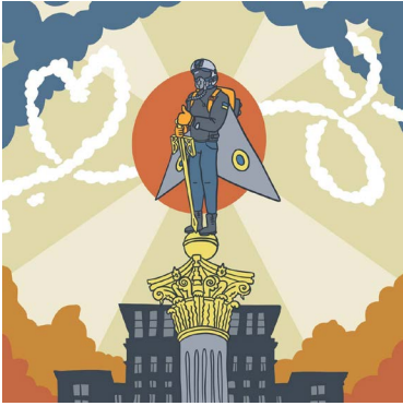
FIGURE 5: AN ILLUSTRATION OF THE GHOST OF KYIV BY DANYLENKO (2022)

Another contextual link is that to the myth of historical heroes, which, in this case, are Ukrainian Cossacks. Many works have been written about the importance of remembrance of the Cossacks to Ukraine’s national myth (E.G. SYSIN 1991; PLOKHY 2014). But most specifically regarding the Ghost, we suggest looking at the lyrics of the song “ Pryzrak Kyieva ” (“The Ghost of Kyiv”) by Serhei Alekseych (2022), which was uploaded to YouTube on 2 March 2022: