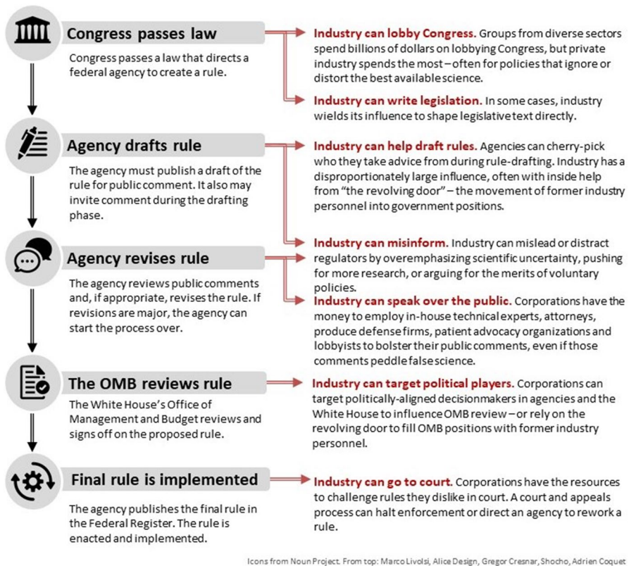
Fig. 2 The federal science-based rulemaking process and industry’s tactics to influence it. Industry may interfere with science-based decisions made by US government officials in the executive and legislative branches throughout the federal policymaking process