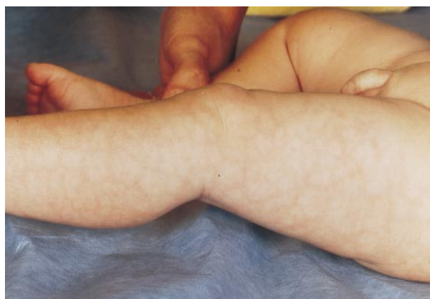
Figure 3. Mottled vascular lesions on the left leg. The upper part of the leg and the pubic region are free of skin lesions.

dysplastic hip; club feet; maldescended testes; an inguinal hernia; lymphangioma; torticollis (2 cases); an enlarged kidney; a malrotated bowel; an asymmetrical skull; a varus-like bowing in the lower legs due to the soft tissue (radiography showed normal skeletal structures); febrile convulsions (also found in the patient's brother, who did