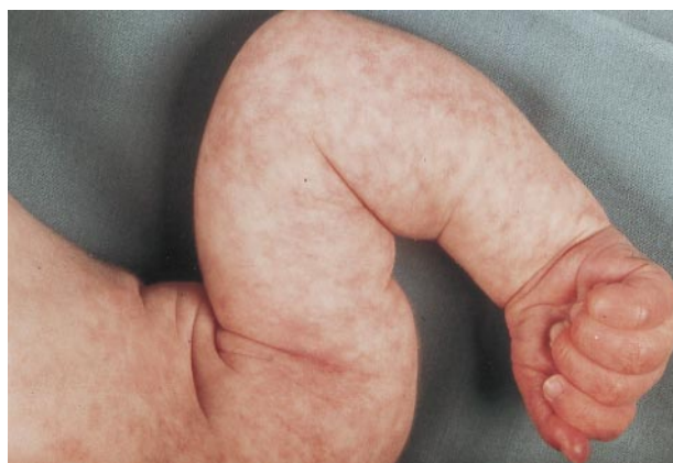
Figure 2. The typical reticulated blue-violet vascular network is present on the right arm.