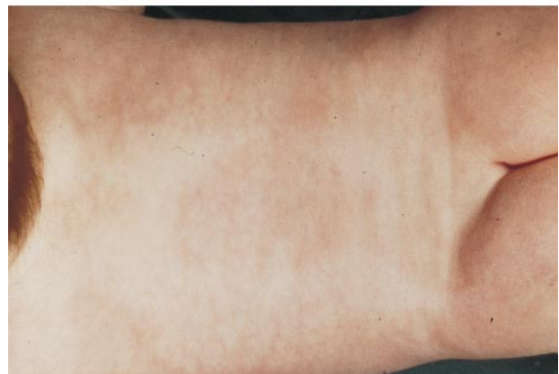
Figure 5. A 1-day-old girl with lesions of cutis marmorata telangiectatica congenita that resemble nevi flammei.