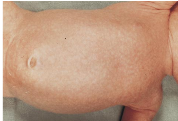
Figure 4. A child with lesions of cutis marmorata telangiectatica congenita that are almost generalized.

Piscascia and Esterly 11 described 1 child (5%) with porencephaly in a group of 22 patients. Powell and Su 10 described 1 child with delayed motor development due to congenital rubella whom we did not include in the group of patients with associated motor retardation. South and Jacobs 8 described 2 children who developed behavioral problems, one in com-