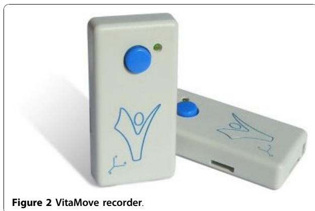
Figure 2 VitaMove recorder.

For ambulatory participants 3 recorders will be used. One recorder will be attached to each thigh to detect acceleration in anterior-posterior direction while standing and a third recorder will be attached to the sternum to detect acceleration in the anterior-posterior direction and in the longitudinal direction. For participants who use wheelchairs, one additional recorder will be attached to each wrist to detect acceleration in the longitudinal direction while seated with the forearm horizontal in