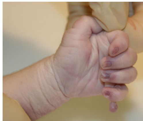
Fig. 2 Postaxial polydactyly type 1 of the left hand of the current case