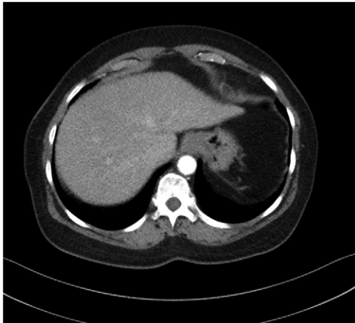
Figure 1: CT scan: no spleen can be detected in the left upper quadrant of the abdomen.

She underwent a complete workup for kidney donation. Similar to her son, she was blood group O positive. Human leucocyte antigens mismatch was 1-1-1, and the crossmatch test with her son was negative. Blood tests revealed a hypothyroidism, as well as slightly elevated HbA1c-levels. The oral glucose tolerance test was normal and her hypothyroidism was medically corrected. Urinalysis showed no abnormalities and urine culture was negative. Virology reports showed no contraindication for kidney donation. A cardiac ultrasound and exercise stress test were normal.