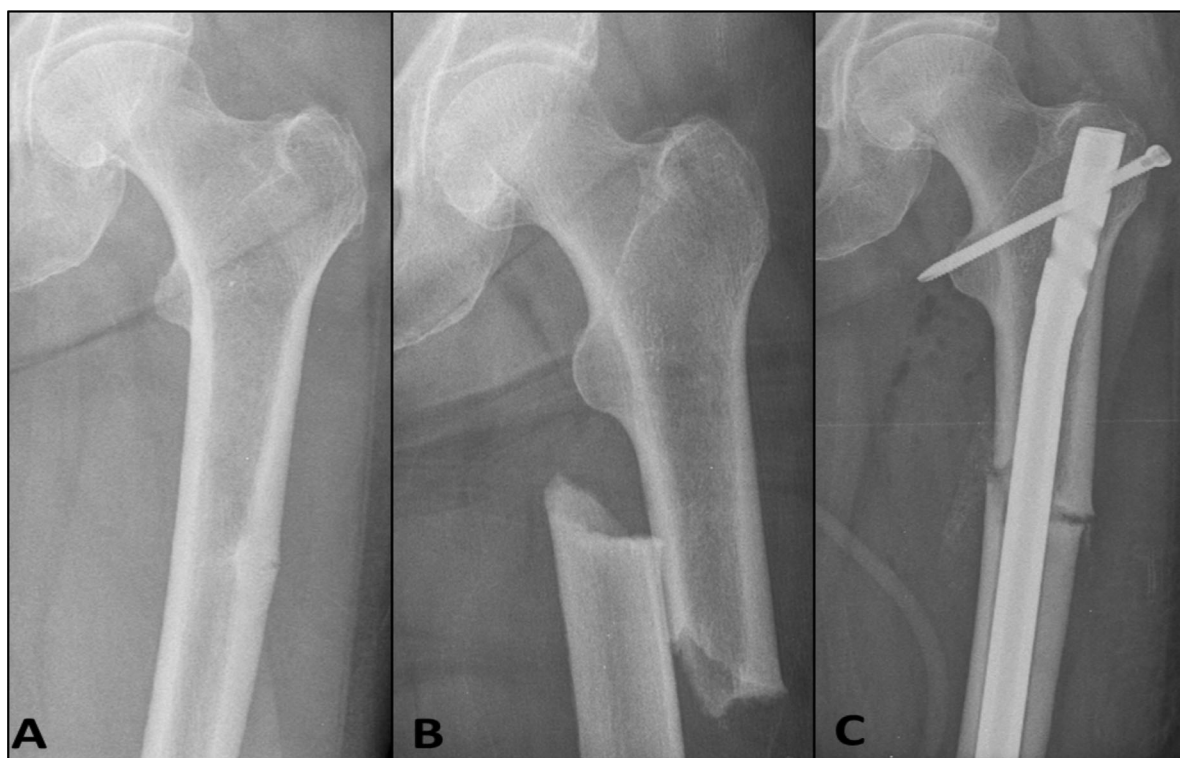
Fig. 1. X-ray series of a 61-year-old woman with postmenopausal osteoporosis presenting with prodromal left thigh pain in the setting of 11 years of alendronate therapy. An initial radiograph of the left femur demonstrated a transverse midshaft lateral stress fracture consistent with an incomplete atypical femoral fracture (A). After a minimal trauma fall, the fracture progressed to a complete fracture (B), and this required surgical fixation with an intramedullary nail (C). Reproduced from Nguyen et al. Bone Rep. 2017;6:34–7.

who comprise about 7% of cases. (2,3) As such, it is likely that genetic variants exist that predispose to AFFs. This article reviews and summarizes the evidence for genetic factors in individuals with AFFs after first discussing the epidemiology and clinical problem of this condition.