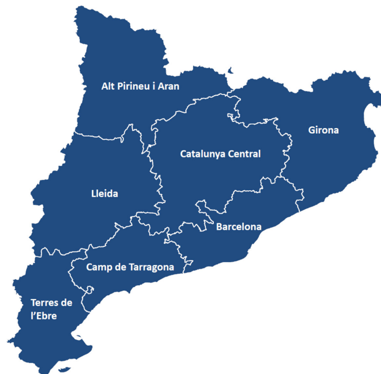
Fig. 2 The figure displays the seven health regions of Catalonia. The urban area of Barcelona (1.8 million citizens) has four health districts. The South-Eastern healthcare sector of the Barcelona city, which encompasses 520 k inhabitants, is Barcelona-Esquerra (AISBE). Taken from the Catalan Health Service (CatSalut) website. https://catsalut.gencat.cat/ca/coneix-catsalut/transparencia/territori/informacio-cartografica/mapes/ This is a public access image.

This protocol will take into consideration the entire population of healthcare users in Catalonia. The health system in Catalonia (7.5 M inhabitants) has three organisational levels, with the seven health regions at the top level (Fig. 2). Each region includes several geographical areas called health districts, second level, covering both specialised and primary care needs of the population. The third level corresponds to clusters of primary care centres within each healthcare district. The region has a