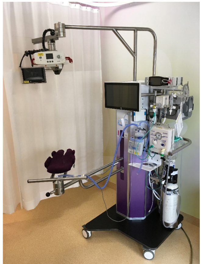
Figure 1 The Concord, a new specially designed resuscitation table, including the platform for the infant, which can be turned above the mother's pelvis. The table is fully equipped to provide complete standard care and has a built-in respiratory function monitor.

A new custom-designed resuscitation table (the Concord, figure 1 ) was used to provide full standard of care for stabilisation of preterm infants at birth with an intact umbilical cord. The Concord is a mobile device, of which the platform can be adjusted to be positioned in very close proximity to the birth canal without stretching the umbilical cord. The platform contains a slit through which the umbilical cord can be placed. The table is provided with the same equipment for resuscitation as used in our standard resuscitation table, being a T-piece ventilator, radiant warmer, suctioning device,