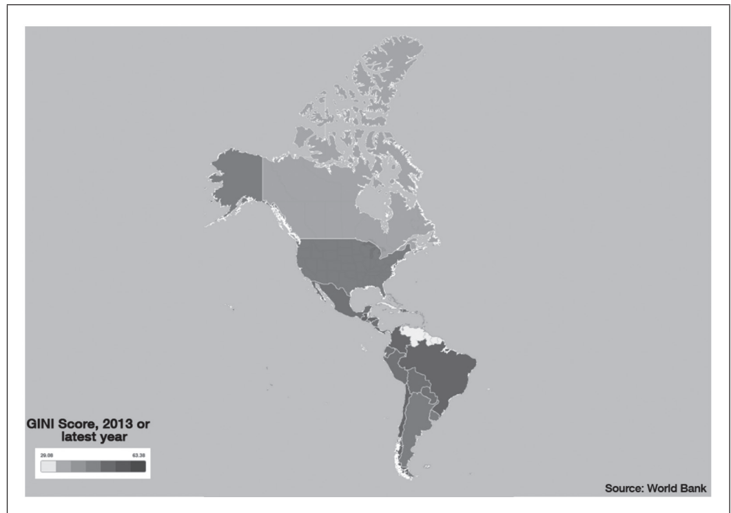
Figure 2 Inequality in America in 2013 using the GINI index (on income) as a measure of inequality for each country 7