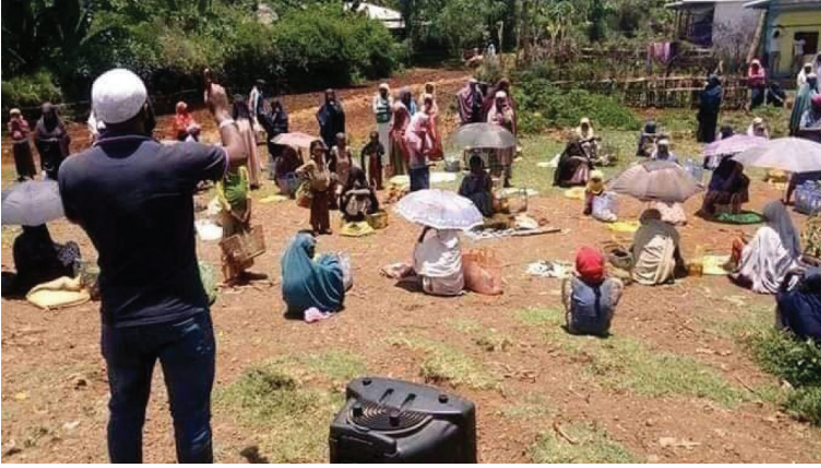
Photo: Awareness creation on “corona-cognizant” marketing of goods by COVID-19 village task force member, SNNPR region, 11 April 2020.

missions to raise funds and buy critical medical equipment and ship to the country.