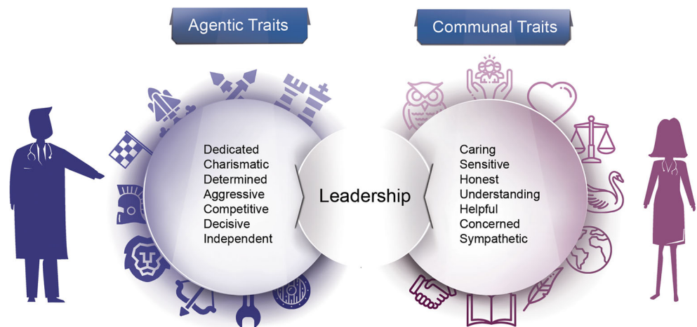
Fig. 3 Demand-role congruity theory: agentic and communal traits associated with male and female gender, respectively (based on Eagly et al [28])

themselves self-critically and reservedly, or not present themselves for leadership positions at all. Male applicants, in contrast, are often admired for their self-confidence and assertiveness and are more likely to present themselves as desirable for positions. It is therefore incumbent upon employers to become aware of their own unconscious biases as well as the unconscious reservations of potential female appointees. In particular, it is important to recognize that women leaders may not fit the traditional mould of male leaders. Female leaders need not adopt stereotypically masculine behaviors to be effective; in contradistinction, they may be more influential and inspiring leaders through emphasis of traditionally feminine traits.