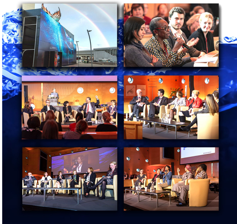
Fig. 1 Impressions from the programme “Women in Focus: Be Inspired” during the 2019 European Congress of Radiology in Vienna

Women in Focus: Be Inspired was a new programme featured at the 2019 European Congress of Radiology in Vienna (Fig. 1). The event was dedicated to the memory of Professor Alexander R. Margulis, a role model and mentor who was ahead of his time in supporting and promoting female leadership [1]. Prominent female and male professionals from academic medicine, public health and the healthcare industry shared their views on topics relating to female leadership. Drawing on ideas discussed during the programme, this article surveys the situation of women in Radiology internationally, focusing on their careers in academia and leadership and highlighting the value of gender diversity for optimizing the quality of clinical care and research. Persistent gaps in gender diversity, and their potential causes, are reviewed, and strategies to enhance the representation of women in academic and leadership positions in Radiology are proposed.