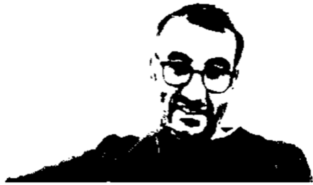
Figure 2. Resident 2's embodied response.