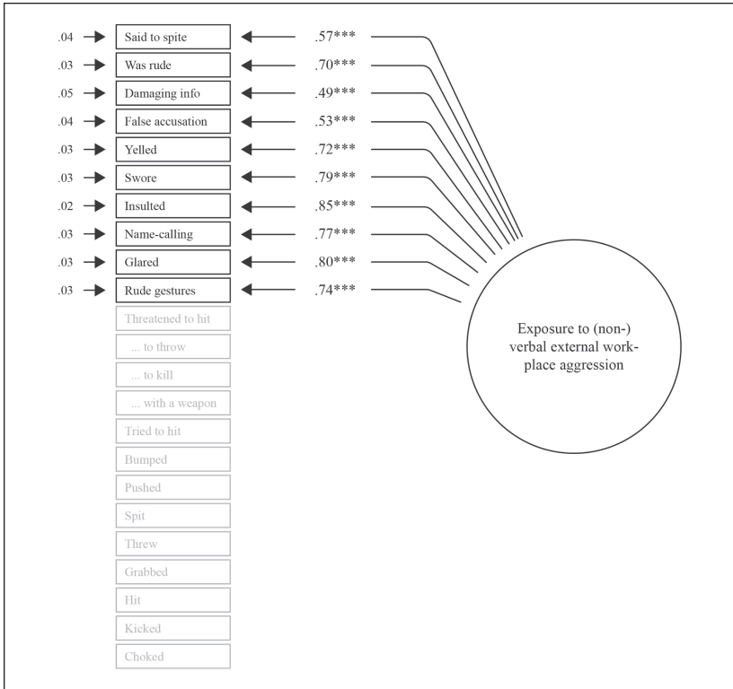
Figure 2. Standardized factor loadings of exposure to external aggression among firefighters. *** p < .001 .

damaging information, false accusations, and having been choked. These items seem to have been perceived as more severe ( M = 4.29, SD = .90, M = 3.99, SD = 1.00, M = 4.89, SD = .43 , respectively, for emergency medical workers; M = 3.82, SD = 1.03; M = 3.95, SD = 1.11, M = 4.68, SD = .70 for police officers) and to have occurred less often ( M = .36, SD = .89, M = .39, SD = .82, M = .08, SD = .08 for emergency medical workers; M = .62, SD = 1.21, M = 1.10, SD = 1.56, M = .02, SD = 24 for police officers), compared to other items, see Table 1. However, for firefighters, transmitted damaging information and false accusations could still be included in the (non-)verbal aggression factor.