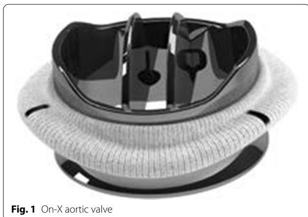
Fig. 1 On-X aortic valve