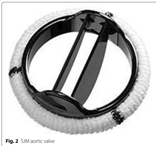
Fig. 2 SJM aortic valve