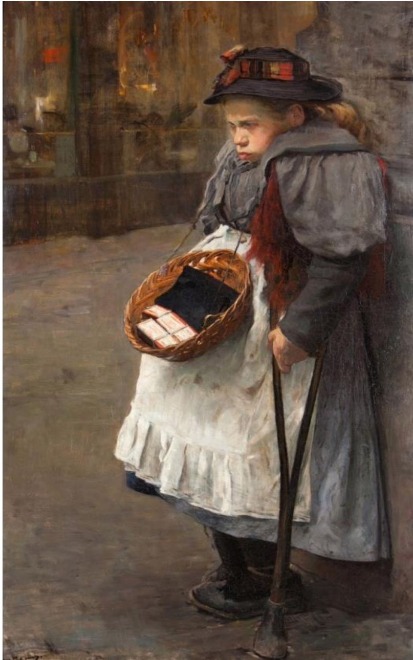
Lucifermeisje (Matchstick girl) by Floris Arntzenius (1864-1925), who lived and worked much of his life in The Hague, the Netherlands. Painting of a disabled girl, who sold matches, probably standing at one of the entrances of the 'Passage' shopping mall, which opened in 1885. (Haags Historisch Museum, The Hague)

She is what the welfare state has tried to support: a disabled child selling matches on a street corner in one of the richest cities in western Europe.