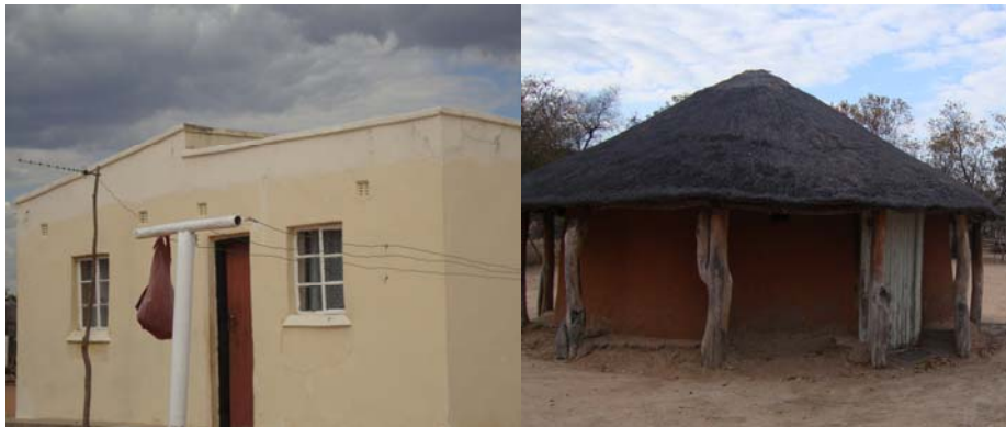
PICTURE 1 Modern vs. traditional housing structures

At community level, remittances were also reported to play a significant role in promoting community development initiatives. In an interview with the Ward Councillor, it became apparent that remittances play a vital role in community development projects in the locale. He highlighted that the migrant community in South Africa since formed a steering committee to help take care of the development issues that need attention in their home area. Two outstanding cases were alluded to through out the fieldwork. These are the local clinic and a local dam that needed to be reconstructed to ensure availability of water for livestock and also for entrepreneurs who may want to grow vegetables. The councillor indicated that the money sent has been very helpful: “For the dam, each household was required to pay ZAR50 and the money was mobilised from the emigrants in South Africa by the stirring committee they have formed. The same was done for the completion of the local clinic which is almost finished now and will be opening soon”.