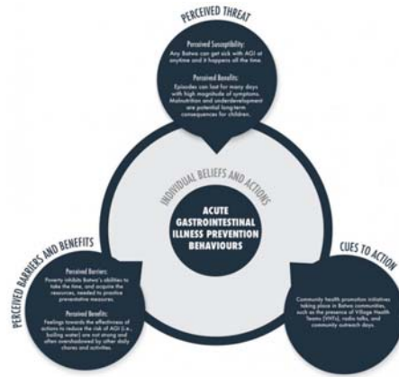
Figure 1: Overview of acute gastrointestinal illness prevention behaviors discussed by key informants and focus group participants.

Perceived threat of illness Focus group participants expressed a perceived severity of illness by articulating that if one gets AGI they 'become badly off', 'become so weak', and 'if it gets worse you can die'. Acute episodes could also last a long time, even 'the length of the week', and lead to more serious long-term health problems such as 'malnourishment' and 'underdevelopment'. Batwa also perceived that everyone was susceptible to AGI, 'because it happens all of the time' in the communities. Many focus group participants believed that they were susceptible to AGI symptoms, yet they did not report many well-known AGI environmental risk factors as being the cause of their AGI symptoms, such as non-boiled water. However, eating 'too much', 'too varied', or 'raw' and 'undercooked foods' were often perceived as a causal link to AGI symptoms. Key informants speculated that the Batwa's lack of perceived threat to many AGI environmental risk factors could be from the Batwa's recent transition to sedentary communities from the forest environments, where their sanitation and hygiene behavioral norms were previously adapted to semi-nomadic, hunter-gatherer lifestyles. A key informant explained: