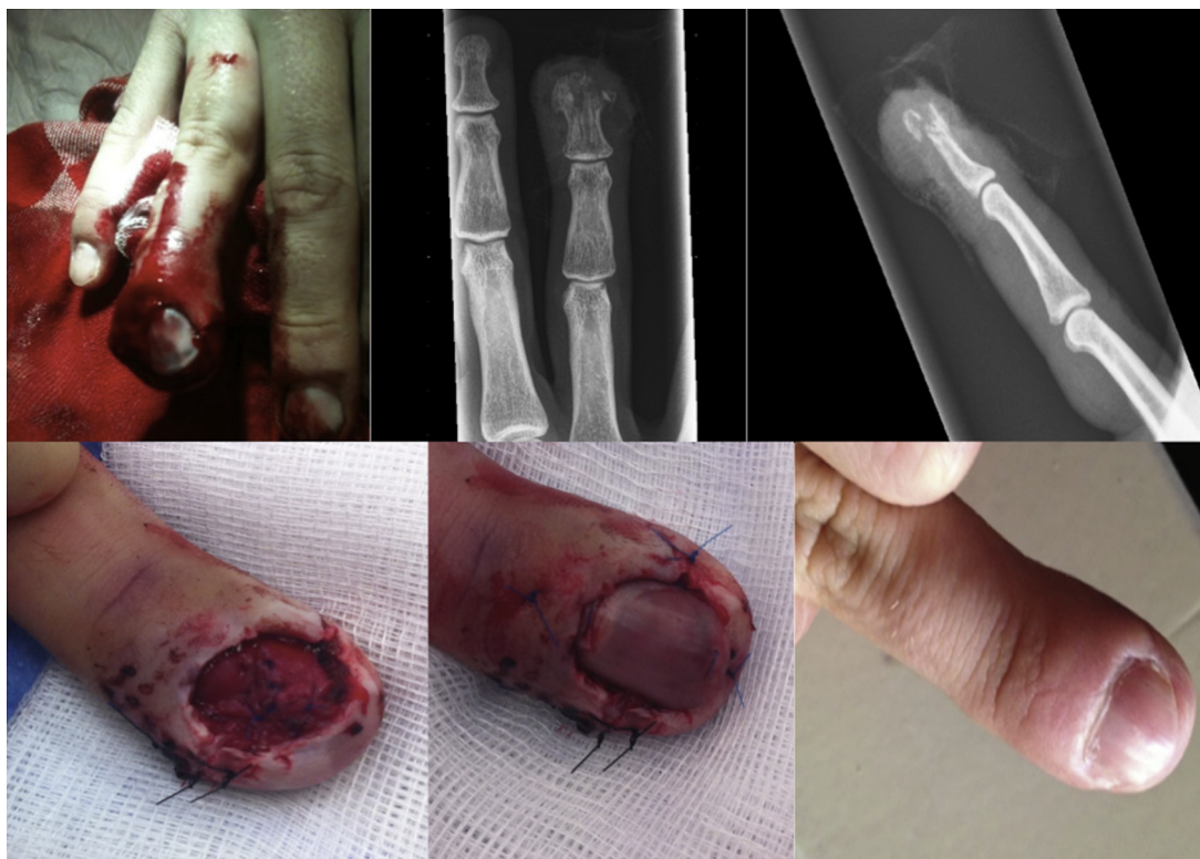
Fig. 1. A = Clinical picture of the initial trauma; B + C = X-ray of the initial trauma; D = peroperative image of the nail bed; E = peroperative image of the nail; F = postoperative image after a 7-month follow-up.

Patients with blunt trauma of the fingertip are mostly encountered by family doctors and emergency physicians [1,3]. Although many injuries require relative simple treatments, nail bed injuries are easily overlooked. If treated inadequately secondary deformities will occur if explained below. It remains difficult to assess the extent of the injury in swollen, painful and bloody fingertips, especially in children as they are less cooperative and less suitable for local anesthetic ring block to aid inspection [6]. Furthermore, an intact nail makes it impossible to assess the damage of the nail bed without removing the nail [6]. In case of nail bed hematomas covering more than 50% of the nail bed without evidence of a fracture and intact nail and nail edges, it is sufficient to evacuate the hematoma through a cauterized hole and leave the nail in place. However, bear in mind that nail bed lacerations may be present in this clinical situation the resulting scar tissue of an unrepaired nail bed laceration can cause deformity and make the patient prone to repetitive infections. The nail plate should be removed in the pres-