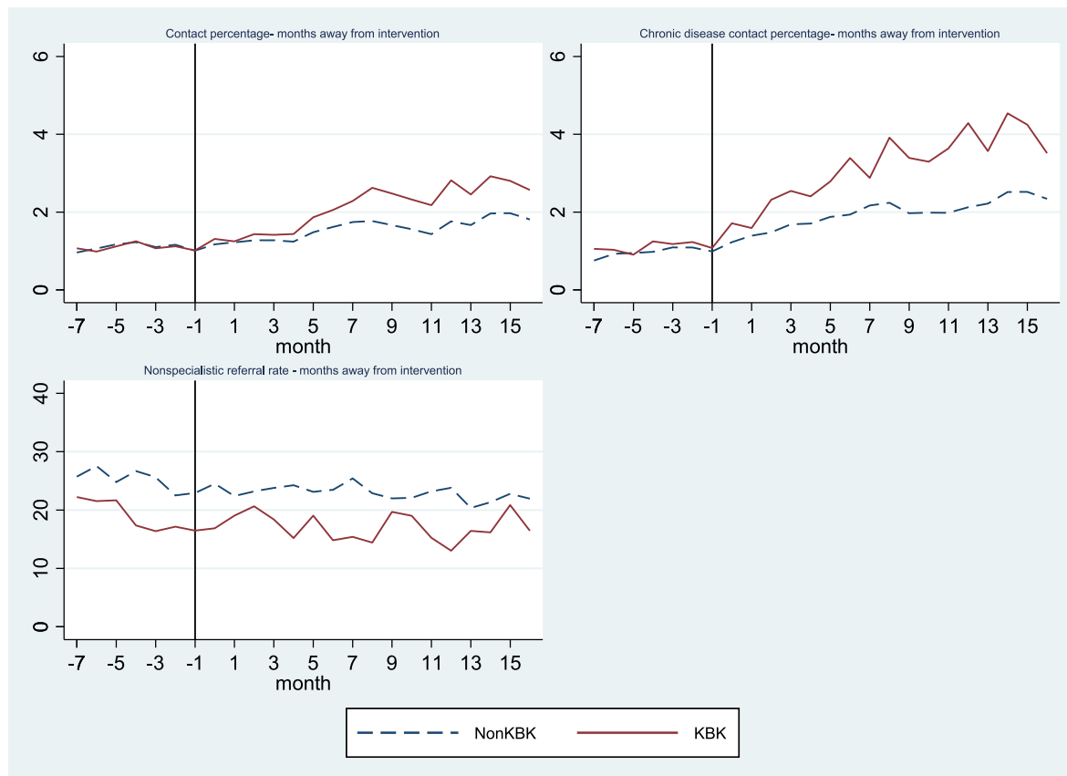
Fig. 1. Coarsened Exact Matching weighted outcomes – months away from KBK announcement. Source: BPJS Kesehatan sample data (2015–2016).

For a more informative graphical illustration of our treatment effects, we present a standard event study graph in Fig. 2 with the month-specific effects of announcement – estimated from a modification of equation (4) where the treatment variable is replaced by the interactions between the KBK treatment group and month dummies. The figure shows the estimated coefficients and their confidence intervals by creating lead and lags from the month that was KBK announced (month -1). In line with Fig. 1, the results support the parallel trend assumption, as the coefficients are stable near zero for the period -7 to -1, and then slowly increase during the 17 months after KBK announcement for