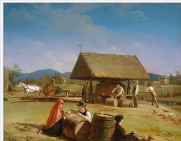
Cider Making, painting by William Sidney Mount, 1840–1841

The history of cider in the United States is very closely tied to the history of apple growing in the country. Most of the 17th- and 18th-century emigrants to America from the British Isles drank hard cider and its variants. Apples were one of the earliest known crops in the English-speaking New World ; ships' manifests show young saplings being carefully planted in barrels and many hopeful farmers bringing bags of seed with them, with the first settlers headed to what is now the Southeast. Within thirty-five years of the settlement of Jamestown in 1607, the land was put to the plow to grow tobacco which provided a source of revenue for the colonists and made British settlement a success in the New World after several failed attempts . However, other edible cash crops were planted, like rice , maize , and apples, since such would have had value in the markets of growing cities like London , Edinburgh , Dublin , and Cardiff .