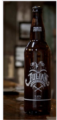
American Hard Cider in a Bottle