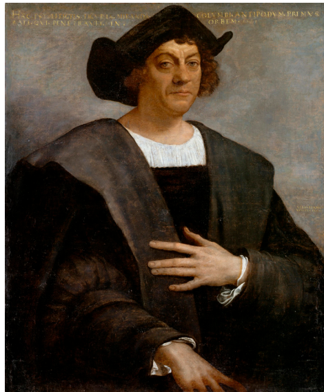
Figures 3a-c Examples of painting images used in Wikipedia articles: a) Portrait of the Imperial Bodyguard Zhanyinbao by unidentified artist (1760). https://en.wikipedia.org/wiki/Bodyguard ; b) Oedipus and the Sphinx by Gustave Moreau (1864). https://en.wikipedia.org/wiki/Sphinx ; c) Christopher Columbus by Sebastiano del Piombo (1519). https://en.wikipedia.org/wiki/Christopher_Columbus