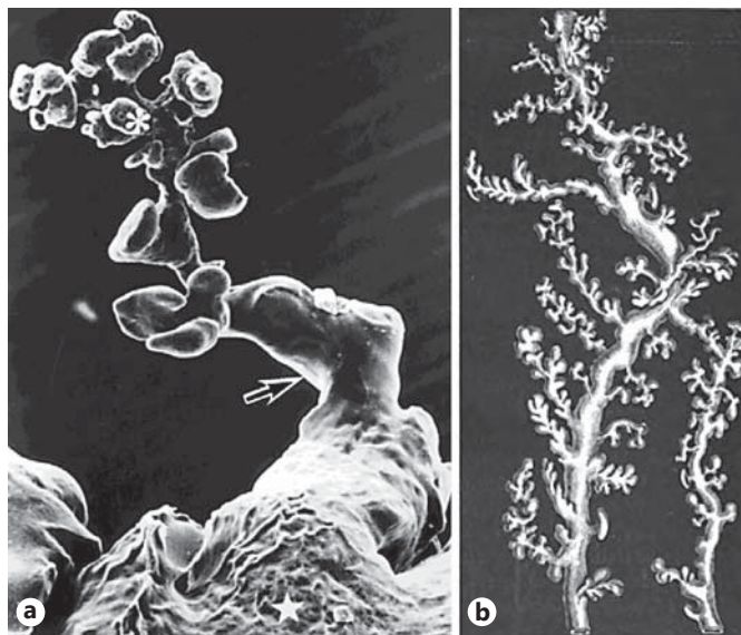
Fig. 3. a Scanning electron microscopy of the peribiliary glands. Reproduced with permission from Ishida et al. [11]. b Grape-like glandular appendices ('drüsen') of the bile ducts as illustrated by von Luschka [1].

by von Luschka that matches today's meaning of the eponym, we believe that 'the duct of Luschka' is a misinterpretation of these glandular structures described by him in the gallbladder wall.