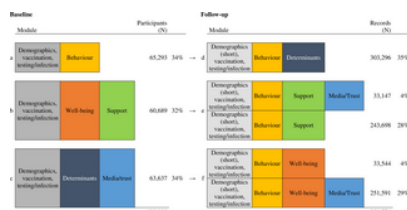
Fig 1. Questionnaire modules in baseline and follow up questionnaires, Corona Behavioral Unit cohort study, April 2020–September 2022.

At baseline, all participants completed an extensive section on demographics (eg, age, educational level, gender, country of birth, living and work situation), socioeconomic status (eg, unemployment, change in financial situation due to the COVID-19 pandemic), health status (eg, having a pre-existing physical medical health condition), and questions on COVID-19 vaccination, testing and infection. Then, they were randomly assigned to the following (combination of) modules ( Fig 1 ): (a) behavior (adherence and social activity), (b) well-being and policy support, and (c) psychosocial determinants of adherence to COVID-19 preventive measures, use of media and trust in the COVID-19 approach of the Dutch government. We opted for this approach to reduce the questionnaire's length to minimize attrition.